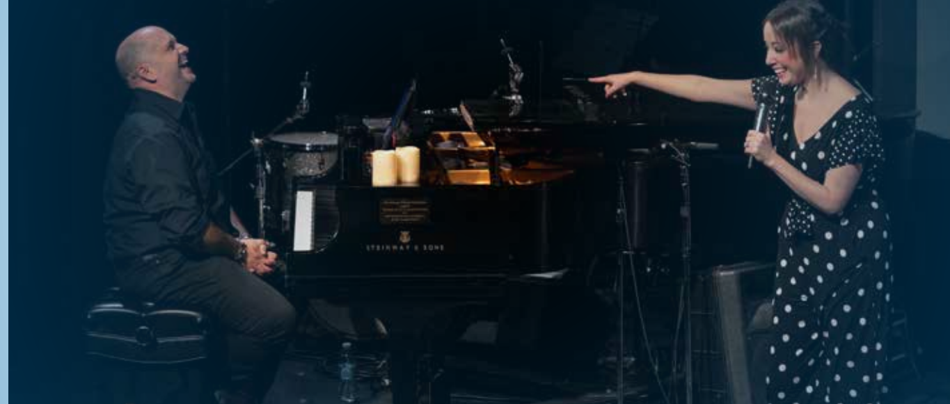
Music 'N' Mavens

Throughout the week, we saw over 7,000 people of all faiths, cultures, and backgrounds visit our great pavilion, with many being first timers. People came here with open minds and open hearts and were embraced by our Jewish community. Many people told us that this Pavilion is what they needed at this time in their lives when they were feeling so low.