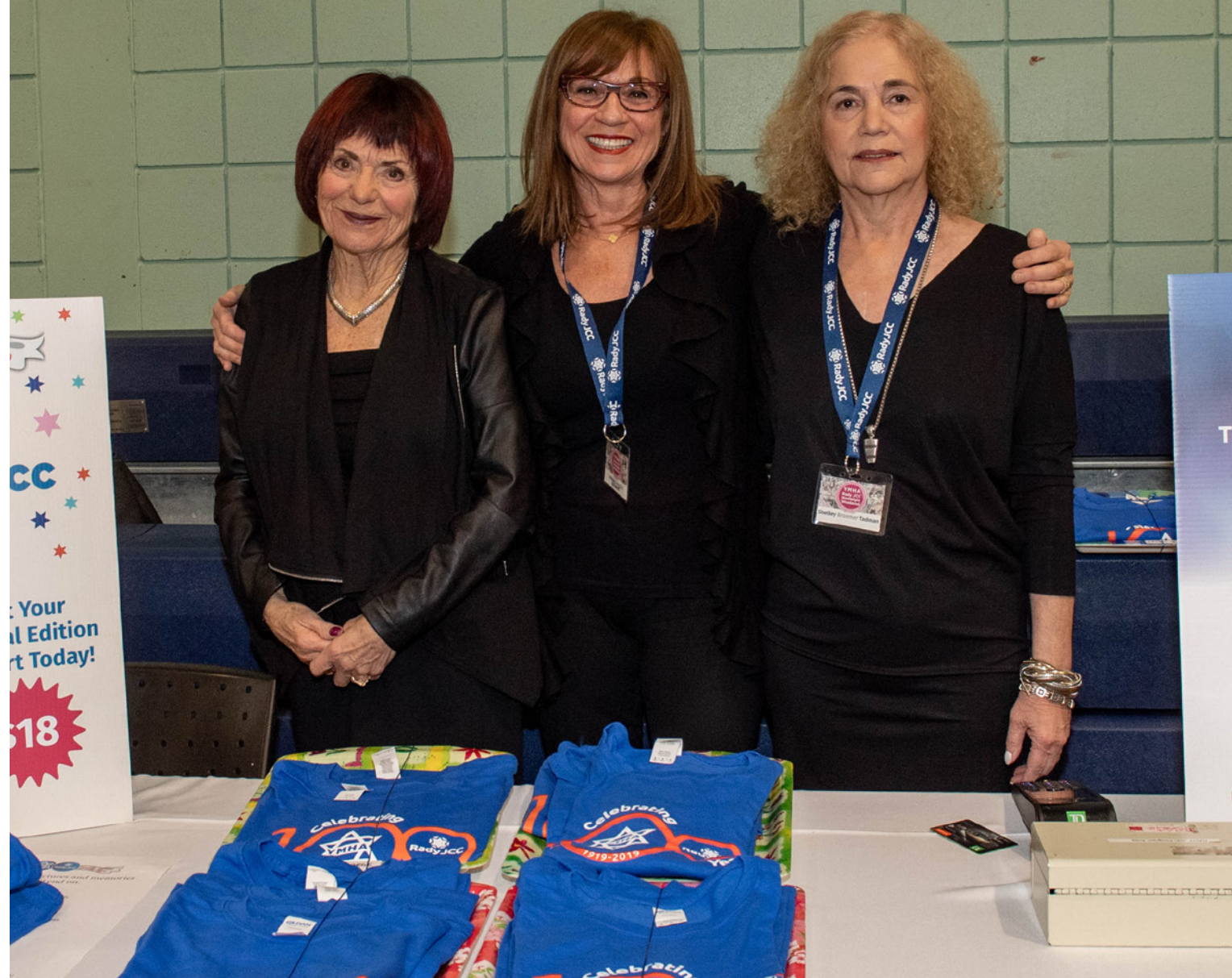
Rady JCC Volunteers

We are a gathering place that is loved and cherished by countless volunteers.