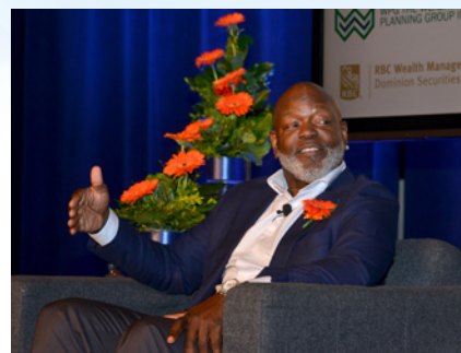
Dallas Cowboy legend Emmitt Smith