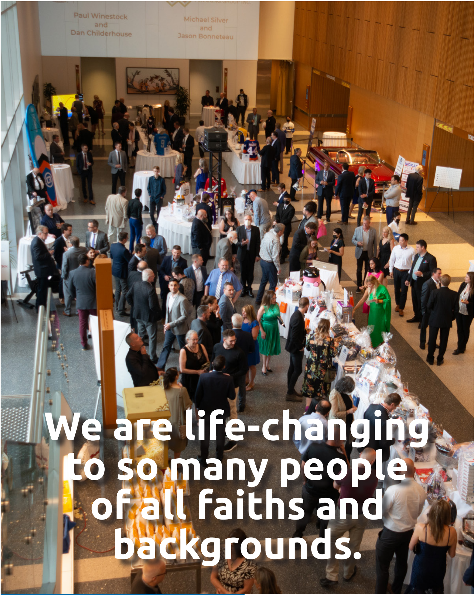
Rady JCC Ken Kronson Sports Dinner

In a year full of uncertainties, one thing was for certain: the love and support of our members, partners, and donors. The outpouring of support showcases the strength of our community and how the people who make it up were there for us when we needed them most.