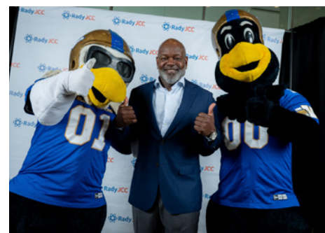
Blue Bombers mascots Buzz and Boomer greeting Emmitt Smith